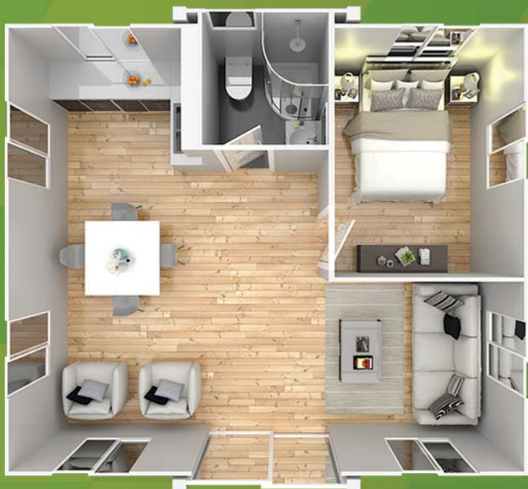
expander standard 1 bedroom