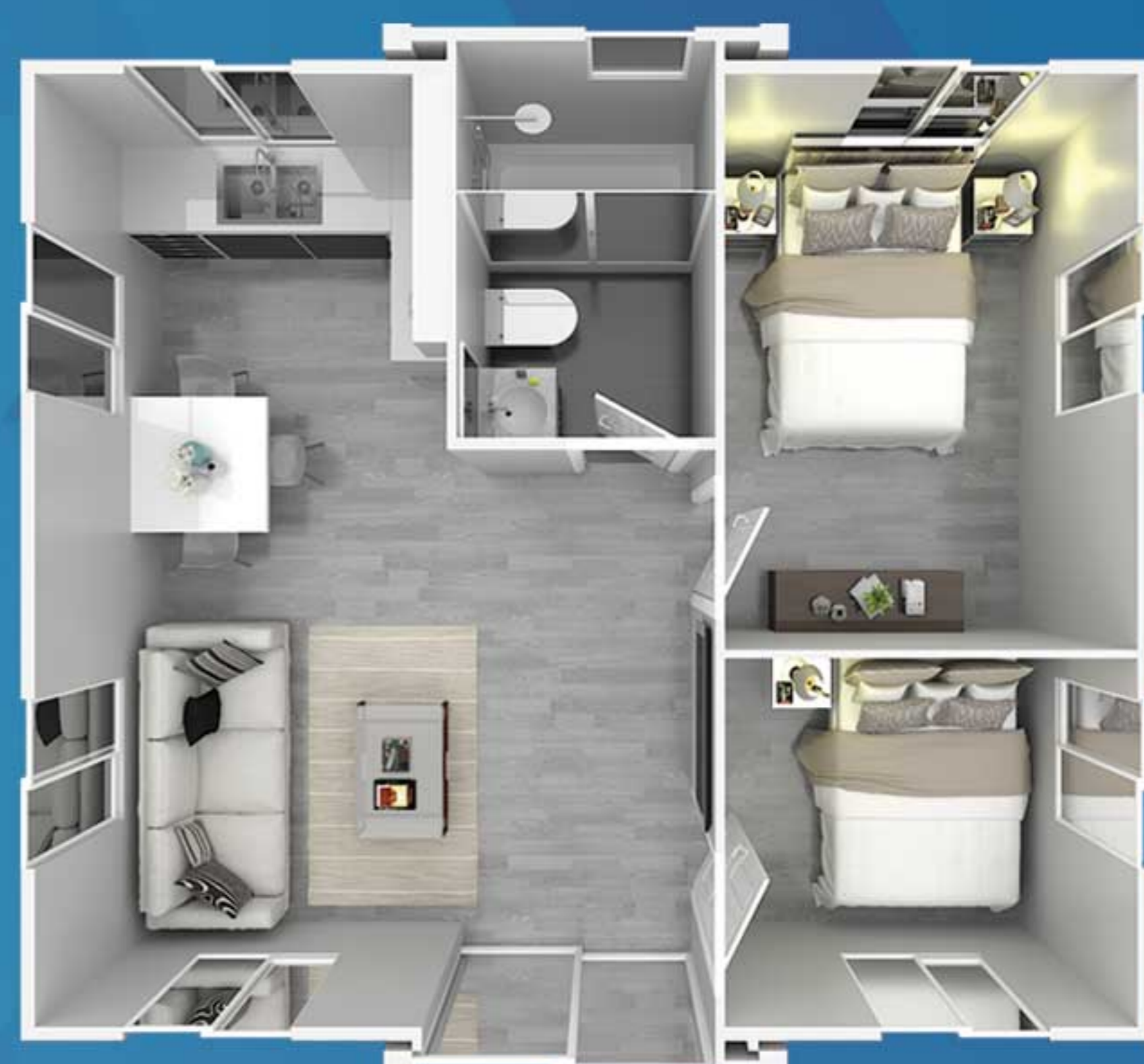
expander premium 2 bedroom