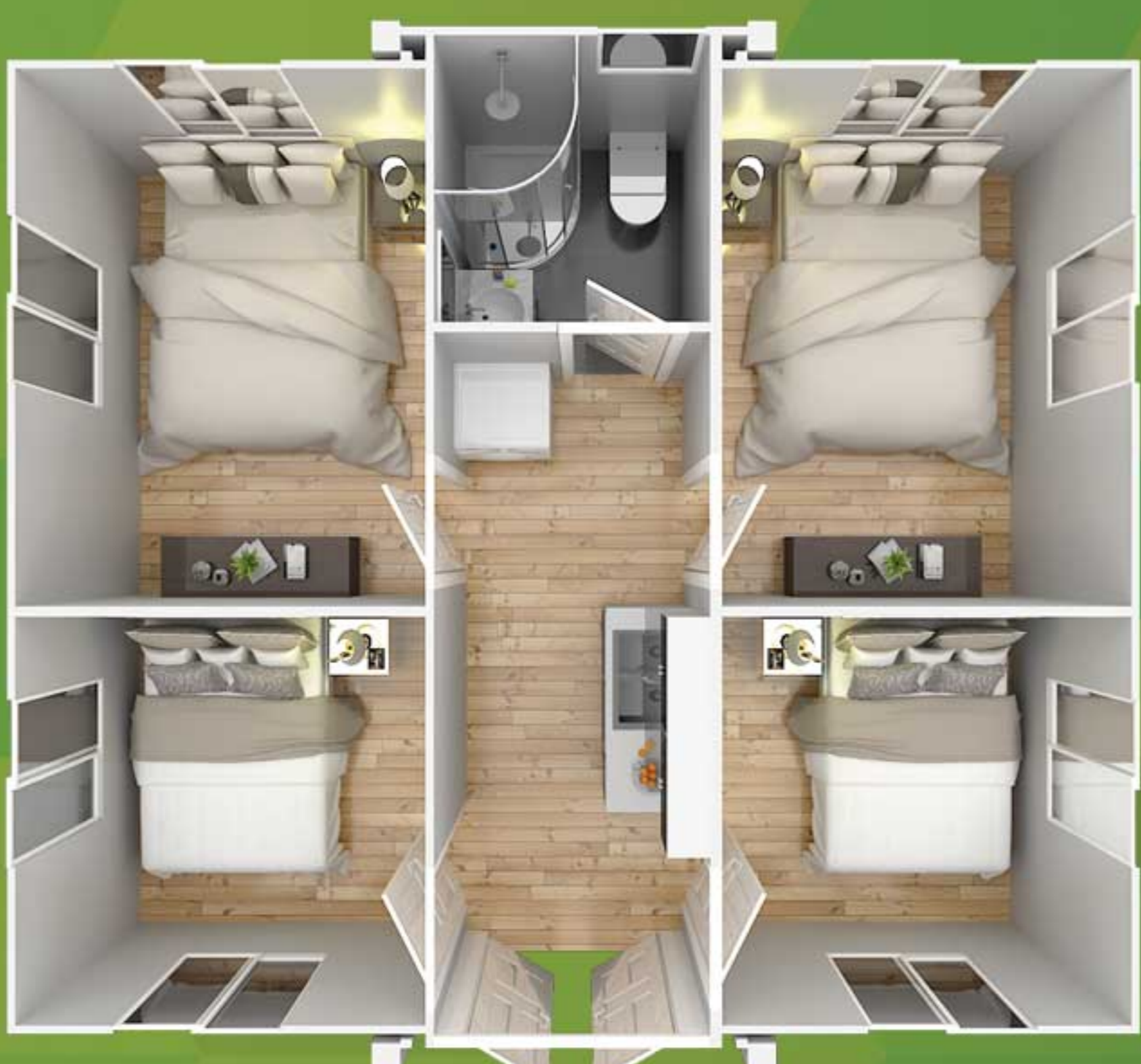
expander standard 4 bedroom