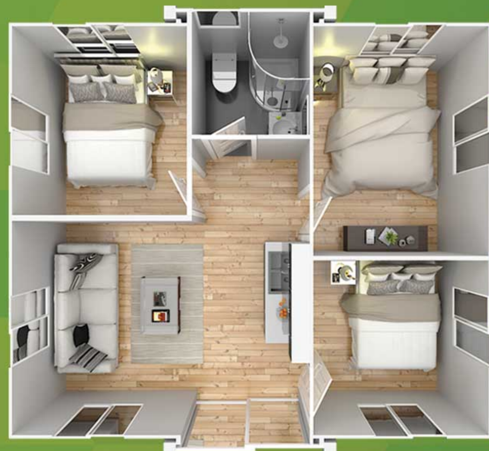
expander standard 3 bedroom